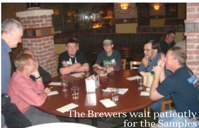
The Brewers wait patiently for the Samples